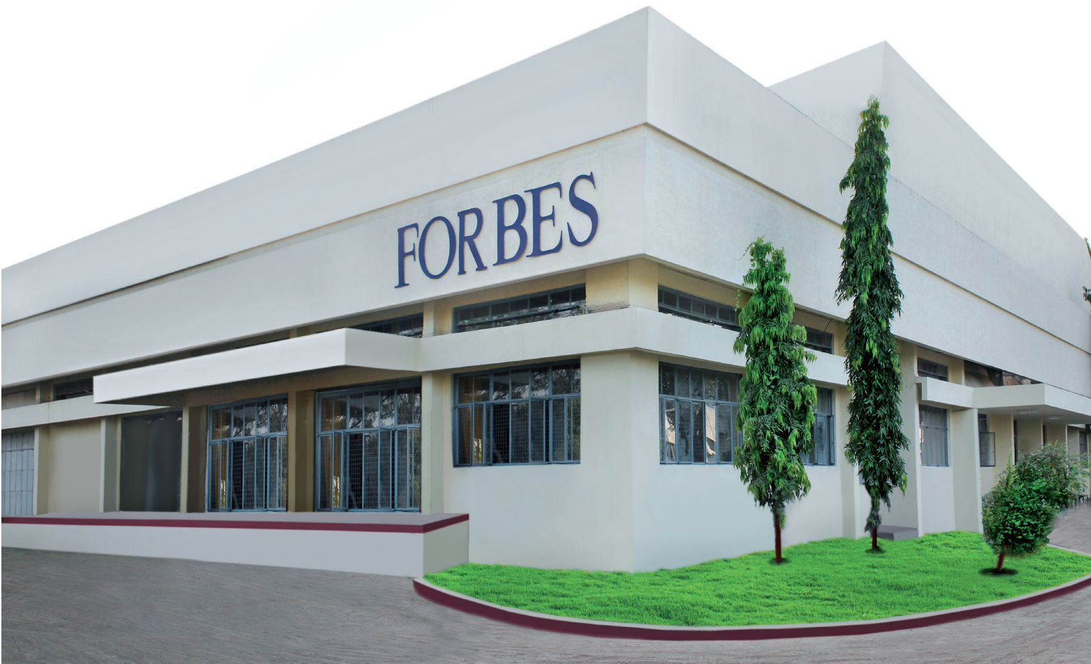
HSS Drills Manufacturing Facility, Waluj Aurangabad